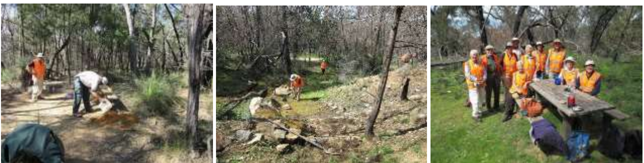
Images L-R: Installing a seat at the old school site; preparing the new steps and path to the powder magazine; track maintenance participants

Kyle showed Brett and Phil an old powder magazine which was off the main track to the township walk.