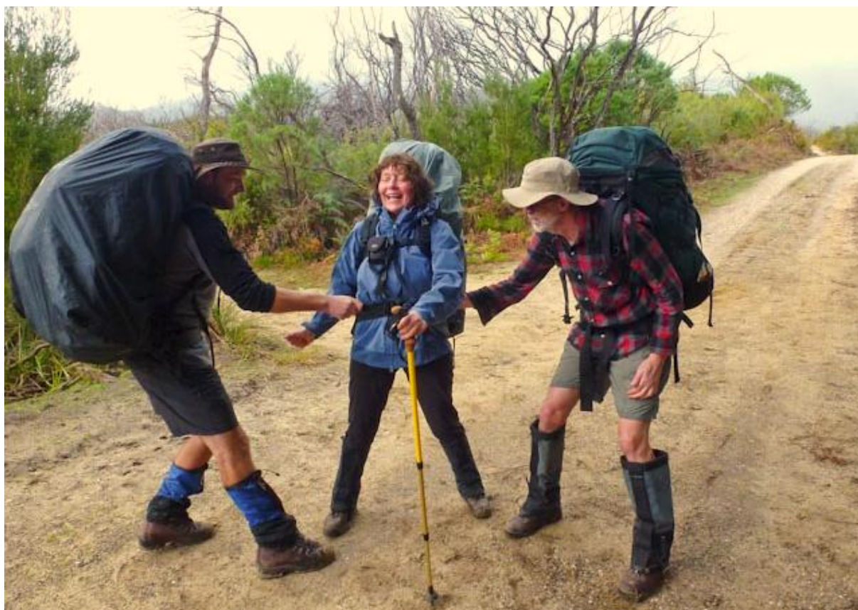
Belt Tightening on the Waterloo Track