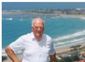
Otway Ranges Walking Track Ass No. A 0034409H