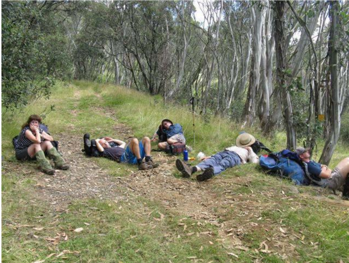
Bushsleeping, Cobungra Ditch, Mt Hotham Boots'n'all, April 2011 No. 352